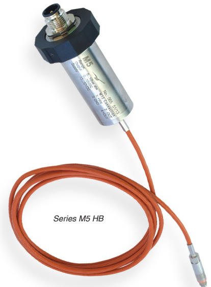
Series M5 HB