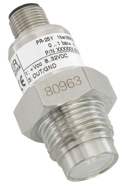
Series 25 Y

A modular concept is used, with fast and economical production achieved by using off-the-shelf sensors. Numerous options and variations are available to meet customers' specific requirements: Pressure ranges, pressure ports, signal outputs, electrical connectors, etc.