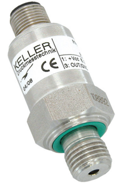
Series 23 SY

The Series 23 SY / 25 Y product line is outstanding due to its extreme ruggedness towards electromagnetic fields. The limits of the CE standard are undercut by a factor of up to 10 with conducted and radiated fields.