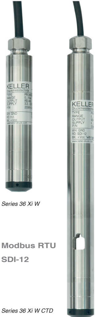
Series 36 Xi W