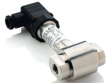
Series PD-33 X