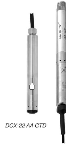
DCX-22 AA CTD

The DCX-22 SG/VG CTD versions have a cable outlet, negating the need to withdraw the instrument from the immersion tube in order to read out the data. A locking disc is used to secure the interface connector at the surface. In the VG version (reference pressure measurement), the reference equalisation capillary tube in the cable is inserted into the upper housing (read-out connector), where the reference opening protected by a Gore-Tex® diaphragm is located.