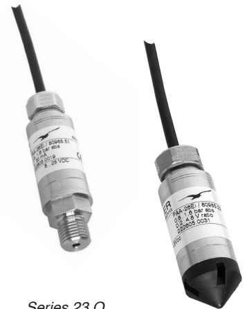
Series 23 Q