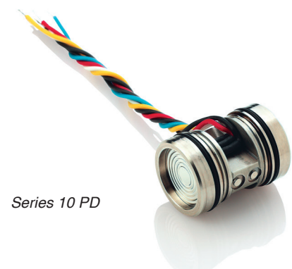
Series 10 PD