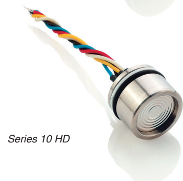
Series 10 HD