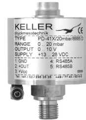
PD-41 X Dimensions ø 50 x 62 mm

All intermediate ranges for the analog output are realizable with no surcharge by spreading the standard ranges. ** Option: Adjustment directly to intermediate ranges (below 20 pieces against surcharge). For higher pressure ranges and for "wet/wet"-differential applications, KELLER offers Series 33 X resp. Series 39 X. ** Note that the error band will then increase proportionally