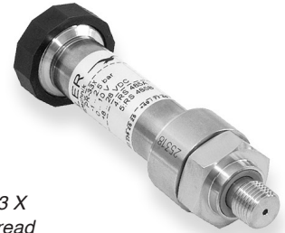
Series 33 X G1/4" thread

The transmitter's full-scale output can be set up to match any standard of your choice by correcting the gain with the PROG30 software.