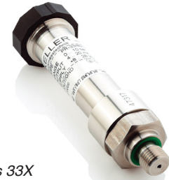
Series 33X G1/4 thread

«Accuracy» is an absolute term, «Precision» a relative term. KELLER uses commercial pressure sources that are at least 4 times better than the product to be tested and can therefore guarantee an accuracy of 0,05 %. Below this range, KELLER uses the term «precision» for the ability of a pressure transmitter or manometer to be within 0,01 % of these commercial standards for every pressure point. These pressure gauges can be adapted to a standard/reference of an accredited laboratory via the digital interface by correcting the zero point and amplification, which guarantees an «accuracy» of 0,01 %FS.