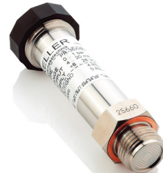
Series 35X G1/2, flush diaphragm