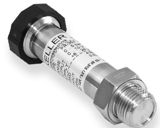
Series 35 X G1/2", flush diaphragm