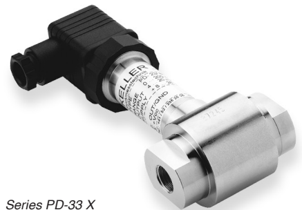
Series PD-33 X