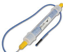
Drying Tube Assembly